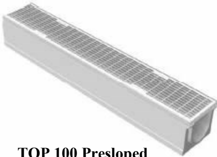
TOP 100 Presloped